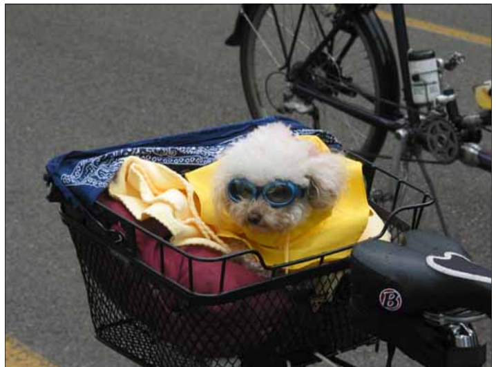
A non-stoking stoker at the 2004 NWTR

Wanted: A quality hybrid or road bike (51 - 53 cm) for under $200. I'm not looking for anything fancy, just a bike to withstand a daily commute (6 miles round trip) and an occasional long trip (50 to 60 miles). Joe McVeety, 757-8660 (H) 715-0782 (W).