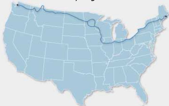
Adventure Cycling Northern Tier Route

times not, for much of the road the railroad is parallel to the road on one side and the other side has telephone poles, the terrain varies from flat to small rollers, from dry irrigation to watered irrigation, lots of wheat grown in northern Montana, there are large silos for grain along the railroad tracks, the white crosses of Hwy 2 (they are put up by the American Legion for each fatality that has occurred on Hwy 2....too many for us to count!), towns have tall water towers with the name of the town on it, from Cut Banks to Shelby we saw oil pumps in the fields, in dry irrigation areas wheat is grown in strips so that the sections can lie fallow for the following years crop to be grown, Havre (for you non-locals it is pronounced "Have-errr") irrigated fields begin using the Milk River and fields include oats, alfalfa, and wheat, wildflowers along the roadsides are beautiful and quite varied (miniature sunflowers are in abundance and are considered a weed here), there is an incredible abundance of prairie dogs, crickets and lots of...small dead birds (swallows, sparrows, and LPJs..."little pretty jobs"), we have seen no birds of prey (vultures or hawks, but have seen lots of sea gulls or as we call 'em...prairie gulls...on the irrigated fields). Whew, so you can see Hwy 2 offers a lot of variety and beautiful countryside. Regardless of what you have heard, it is not a boring landscape and Montana is beautiful and the countryside is