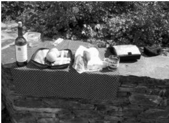
A perfect picnic in the countryside

The hotels weren't expensive, averaging less than $40/night. Sometimes that included breakfast. Of course, we weren't staying in 3 or 4 star hotels either - they usually weren't available in the small villages anyway. Overall, our trip averaged about $35/person/day rather than the $235-285/person/day for an organized tour. That figure includes all expenses within country - foreign travel doesn't have to be expensive. As one of my favorite travel writers puts it, 'money just places a barrier between you and the people'. We didn't allow that to happen. Yes, I'm sure that we missed some local highlights that a guide would have