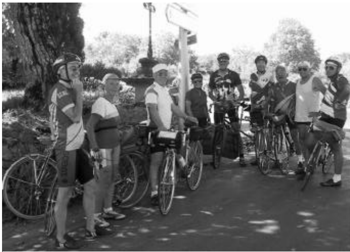
Conversing with French cyclists

Send to: MID-VALLEY BICYCLE CLUB, P.O. Box 1373, Corvallis, OR 97339-1373